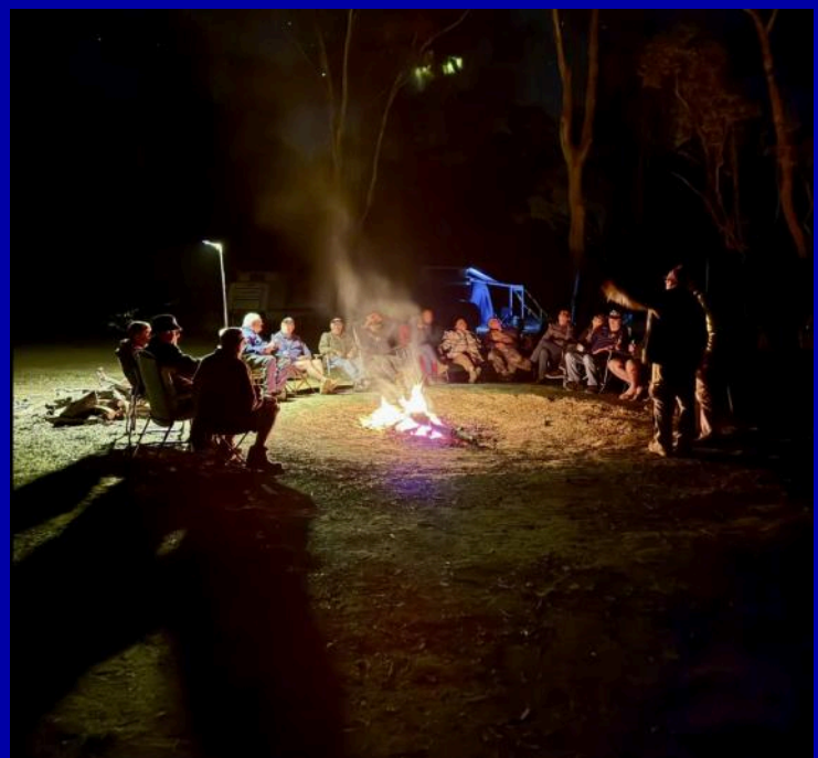
Moliagul Camp Fire