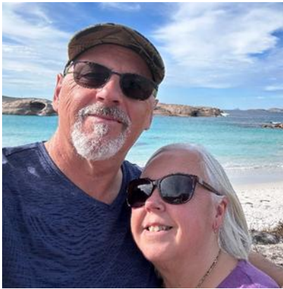
(The President and his wonderful "First lady")