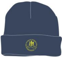
Acrylic Beanie - Toque - 4243