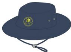
Brushed Heavy Sports Twill Hat - 4250