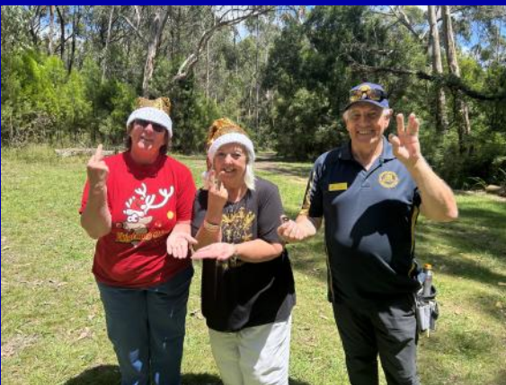
Christmas Breakup Stake your Claim Winners